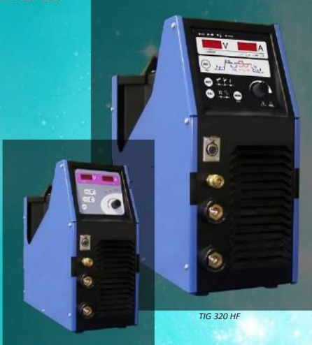
Stick 320 LA-V